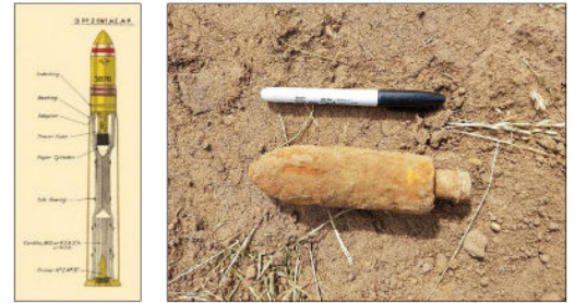
Image showing a 3pdr high explosive (HE) projectile which was found at a depth of 0.3m, as indicated by the computer modelling.

Following approximately four-months of ground investigation and remediation works, the risk from UXO had been reduced to ALARP status – and the client completed the project without unearthing any additional UXO discoveries.