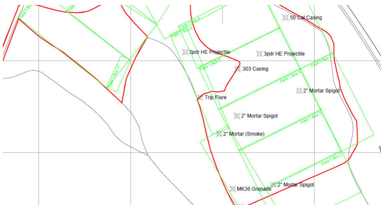
This diagram shows the 1st Line Defence survey boxes overlaid with the location of some of the UXO finds which were modelled and later physically investigated.

We worked closely with the client and the site supervisor to make sure that any disturbances or risks were fully assessed, so that the survey and target investigation operations could be carried out on time and in budget.