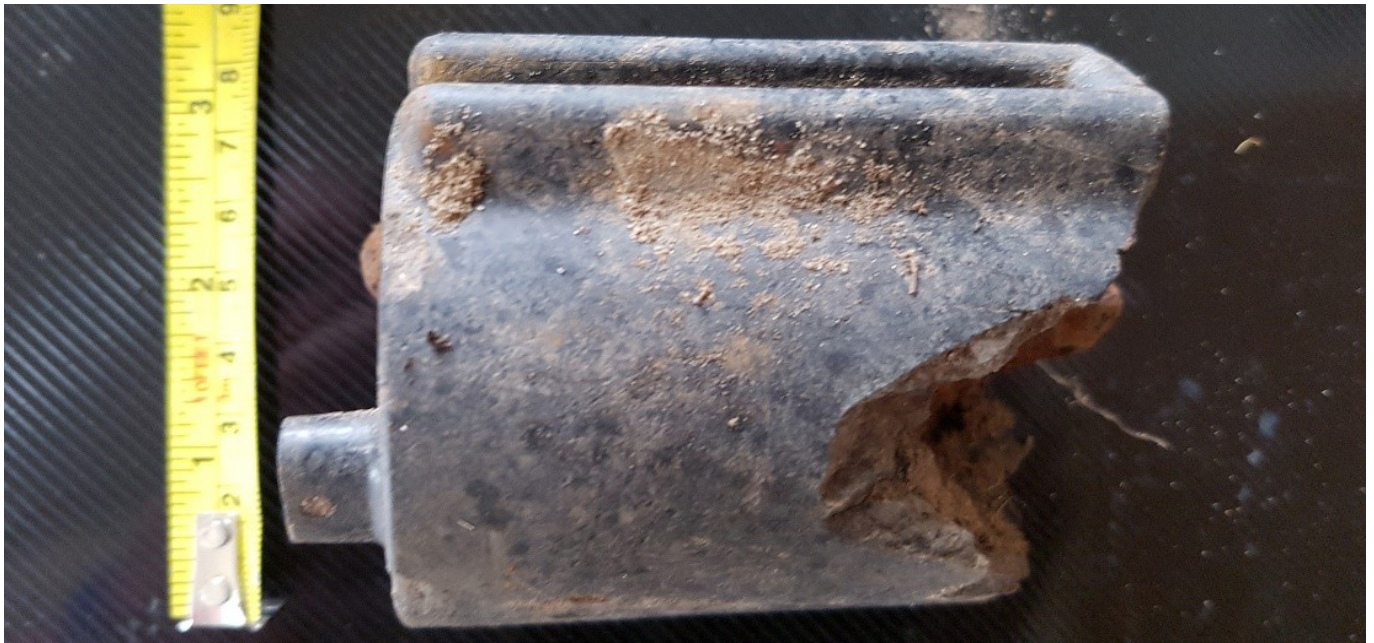
Trip-wire Flare, Mk 1. This item was modelled at a depth of 0.5m, with a 0.3l volume. It was found during Target Investigation to be at just over 0.3m.