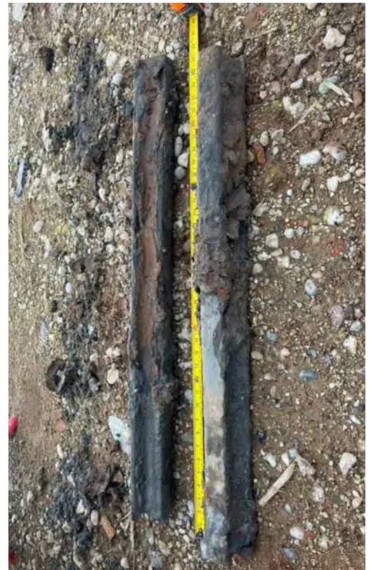
Example of some of the anomalies found in the shafts at Liverpool Docks.