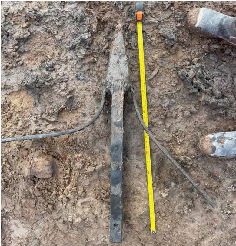
One of the anomalies found in the shafts at Liverpool Docks.