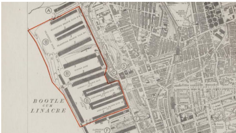
Luftwaffe target map, Liverpool Docks, 1939.

According to various sources, the quay and the area surrounding it sustained numerous bomb strikes. Liverpool bomb tracings highlighted multiple high explosive and incendiary bomb strikes within and adjacent to the site, many of which were corroborated within available written bomb incident records and published sources.