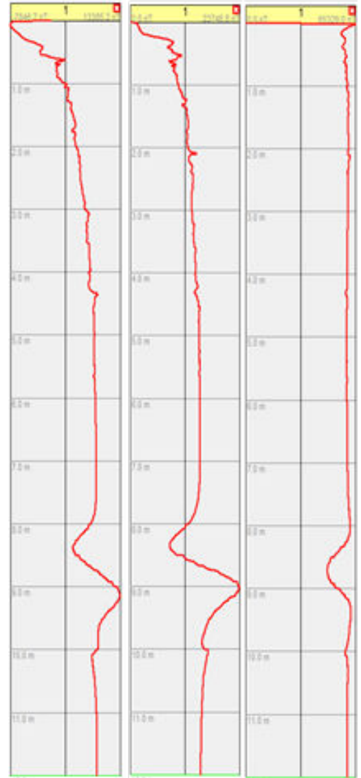
Image showing a used Smoke Grenade and other items of explosive ordnance found on-site during the first phase of UXO Watching Brief Support.

We consulted with the client to see if those positions could be adjusted for piling purposes but due to a lack of space available on the project, the client decided to excavate the anomalies. RAMS were adjusted and suitable shafts were created to allow our UXO Specialists to investigate the anomalies – using push and dig methodology. These shafts were essential to the investigation and excavation procedure in order to undertake the investigation safely.