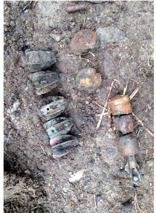
Parts from various types of (Inert) ordnance found during a Search & Clear operation in Loch Rannoch, Scotland.