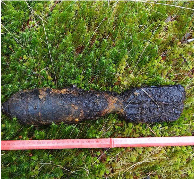
Image of a 3-inch mortar round found during Target Investigation in Loch Rannoch, Scotland.