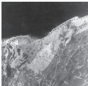
RAF Aerial Imagery of Loch Rannoch, Scotland.