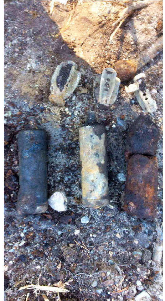
Several 2-inch mortar rounds (Inert) found during a Search & Clear operation in Loch Rannoch, Scotland.

Following approximately two months of risk assessments and ground investigations, the risk from UXO was reduced to ALARP status – no further items were discovered and the hydroelectric scheme was fully operational by October 2015.